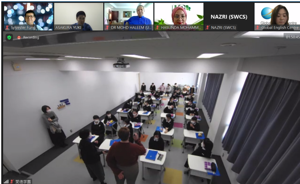
Screenshot photo during the online engagement with Japanese High School students.